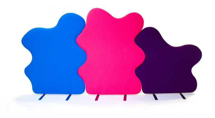
Step 2 Position the screens next to each other to create the desired configuration.